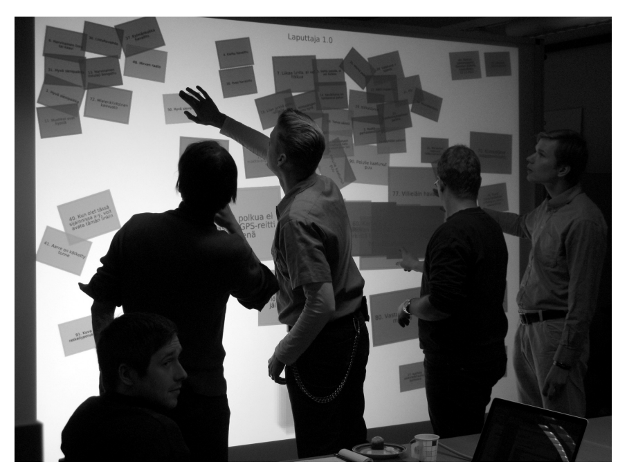
Fig. 1: A multi-touch wall was used to organise the different kinds of hiking-related notes into groups with a similar content

Based on these topics, we selected the content that is relevant to the users while on a hike. Focusing on the informative content, we selected a few spots along a popular hiking route in Nuuksio National Park, near Helsinki, and composed nine descriptions of these spots. The aim was to communicate information to the user that she/he would not be able to directly see while walking in the forest. The information could also be something that is not directly shown on the map. We also chose to include some information that is visible on the map, but which users might wish to avoid having to read while hiking. The audio descriptions can be thought of as a metaphor for a museum tour, during which time additional information is given on interesting subjects. The chosen information topics are as follows: