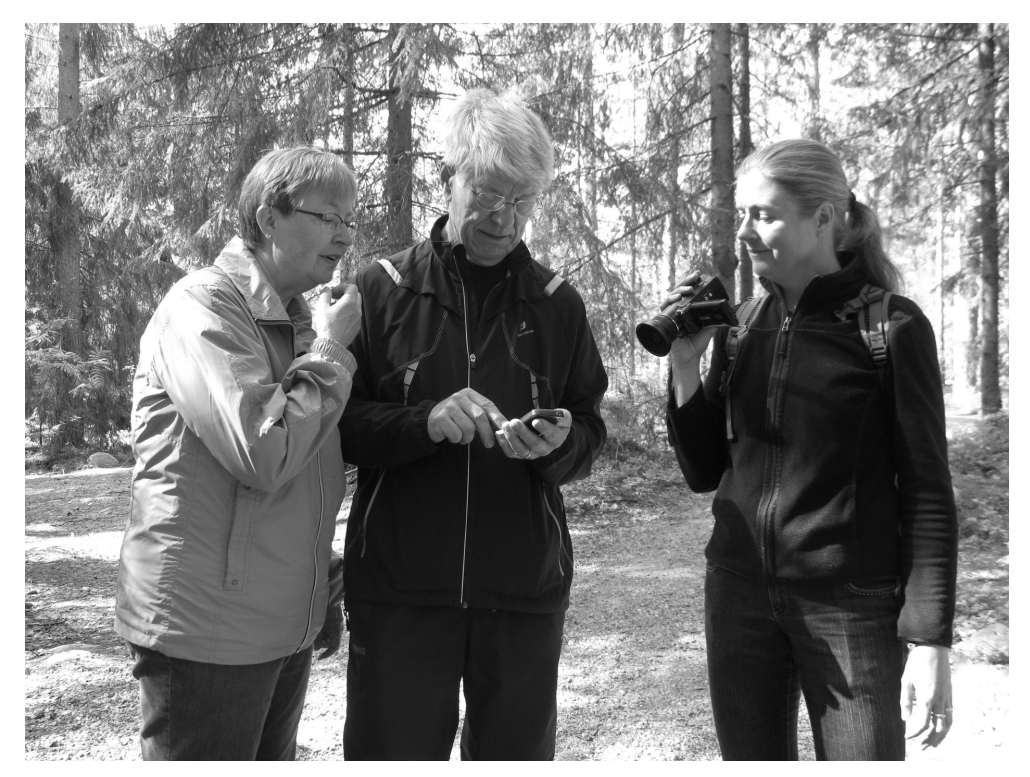
Fig. 3: The setting for the field studies

We were interested in how the elderly users would adopt the novel way of using maps, whether the audio feature would improve accessibility and, in general, whether the users would find the map application and the descriptive map content useful. We also wanted to know what kind of information the users would have wanted to have received from the map application.