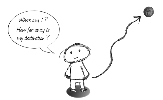
Fig. 4: The position, the direction and the distance information are of user's primary interest

Based on the analysis of user experiences, we summarise the most important features regarding the information communicated by a mobile map application as follows: 1) Reliability, 2) Content and 3) Communication.