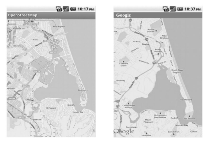
Fig. 1: OpenStreetMap and Google Maps in Smartphone applications

The GPS and the Wi-Fi receiver are important for the position determination and the permanent Internet connection is necessary for the map visualization as well as for the service provider request. The first task of the mobile client is to get the position of the smartphone. OS of smartphones offer an interface to get access to the location of the device. The second task is to send the coordinates of the position to the service provider and interpret the response.