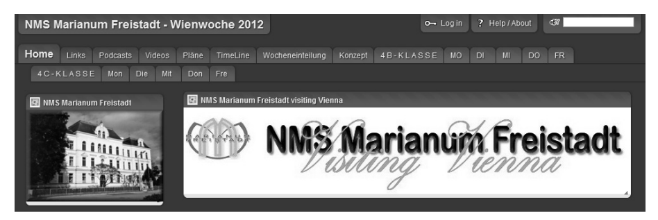
Fig. 3: Mashup-application

Apart from the e-learning software platform Moodle there is a second main area of preparation: This is a predefined collection of various multimedia-based Web contents implemented by a Web 2.0 tool called "Protopage". "Protopage" is a representative of the mashup technology on the Internet.