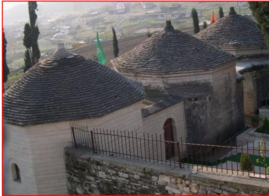
Figure 3. Gateway to a Bektashi tyrbe displaying the Albanian national flag and the Bektashi motto 'without country there is no faith'.