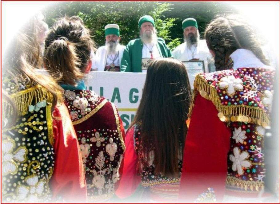
Figure 5. The footstep of Sari Salltëk in the city of Krujë, north of Tirana is a site of visitation and destination for the Bektashi pilgrims.