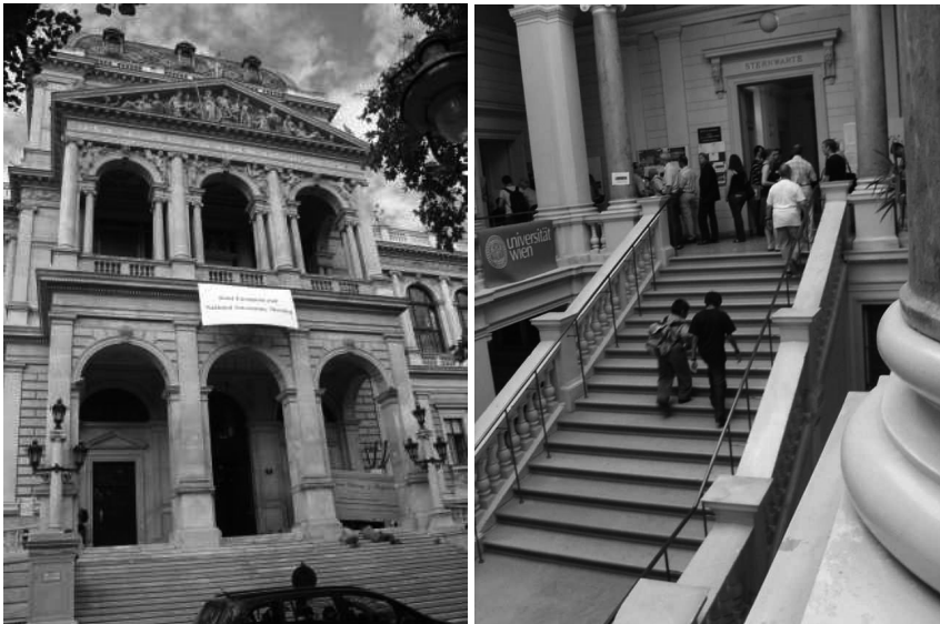
The conference venue: main building of the University of Vienna; and reception and registration at the University Observatory.