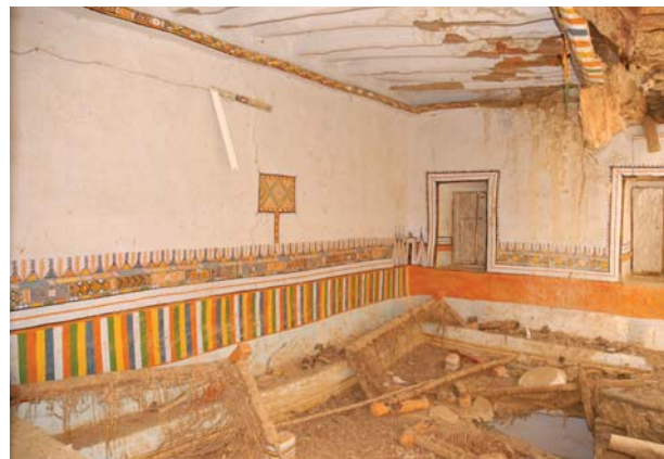
3. Painting by the the artist Fatma Abo Gahas.

Other powder colours were brought from Adan in the south of the Arabian Peninsula. Different types of red and black mud were also used for colouring; all the colours were used independently, without being mixed with one another. This imposed a limited choice of colours, depending on what pigments were locally available.