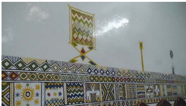
4. Painting by Fatma Abo Gahas in her son's house.

When attempting to understand and situate a cultural production, we naturally turn to a comparison of the features that we find recognisable and logical according to our own experience. In that case the following question arises: why is there an exclusive use of straight geometric