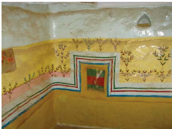
2. House in Blad Qahtan.

Black Paint: The woman pounds some alfalfa grass and then squeezes and strains it. A candle or kerosene lamp is then lit and a plate or similar receptacle is placed in the flame to gather soot, which is then added to the alfalfa grass to turn it black. This method is in addition to the use of black tar ( qutran ), extracted from al-Athel tree which is burnt whilst green to produce a dripping oil.