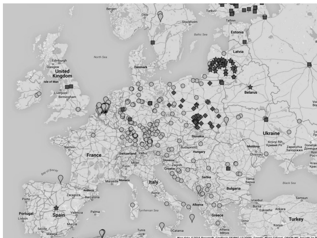
Fig. 3: Birthplaces of grandparents for students at the Adolf-Weber-Gymnasium in Munich, Germany (excerpt for parts of Europe in Google Maps), in round dots, students from Finland in squares, from Poland in diamonds, from Belgium in beads and from Lithuania in stars.

The latest project work comparing results from different countries via geomedial was taking the aspect of living conditions a bit further, and asked the students for the origin (birthplace, if known) of their grandparents, thus describing the ethnic background of their respective neighbourhood. The collection of data is very easy, again with analogue maps, first at a national, second at a European, and last at a World level. Then the points were inserted into a digital map (My Map in Google) with different colours for the different schools (Fig. 3).