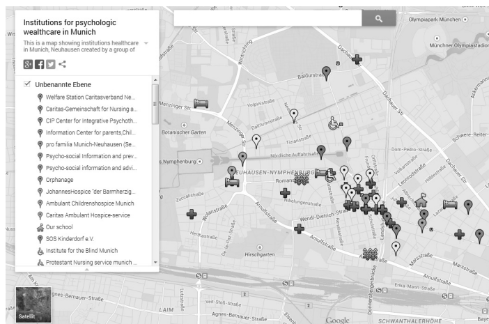
Fig. 4: First issue of the map of institutions for healthcare (including spelling mis-takes) for the vicinity of the Adolf-Weber-Gymnasium in Munich (Google Maps).

Another project, more locally executed, involved the collection of healthcare institutions in the area close to the school in Munich. It was easily done by just inserting point symbols into the map (using Google Maps again) and a result can be seen in Fig. 4.