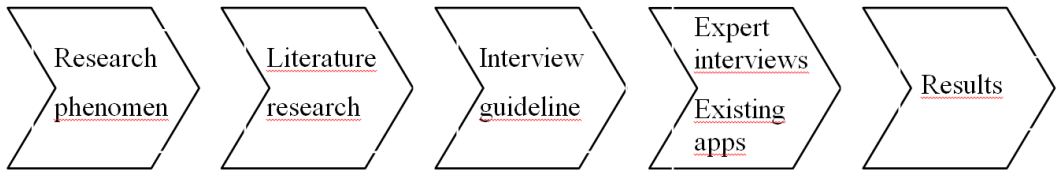
Figure 1: Research Design