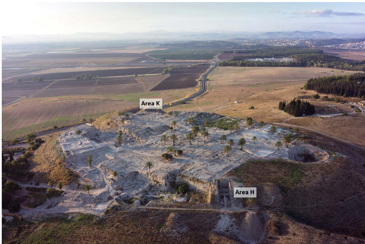
Fig. 1 Aerial view of Megiddo, looking south, marking the two areas of excavation discussed in the article.

studied in a reasonably large exposure (twelve 5 \times 5 squares in Area K and eight in Area H – the two excavation areas which make up the backbone of the discussion below; Fig. 1) and supplied large assemblages of finds. The combination of all these factors makes the site a unique laboratory for the study of minute changes in material culture and economic practices.