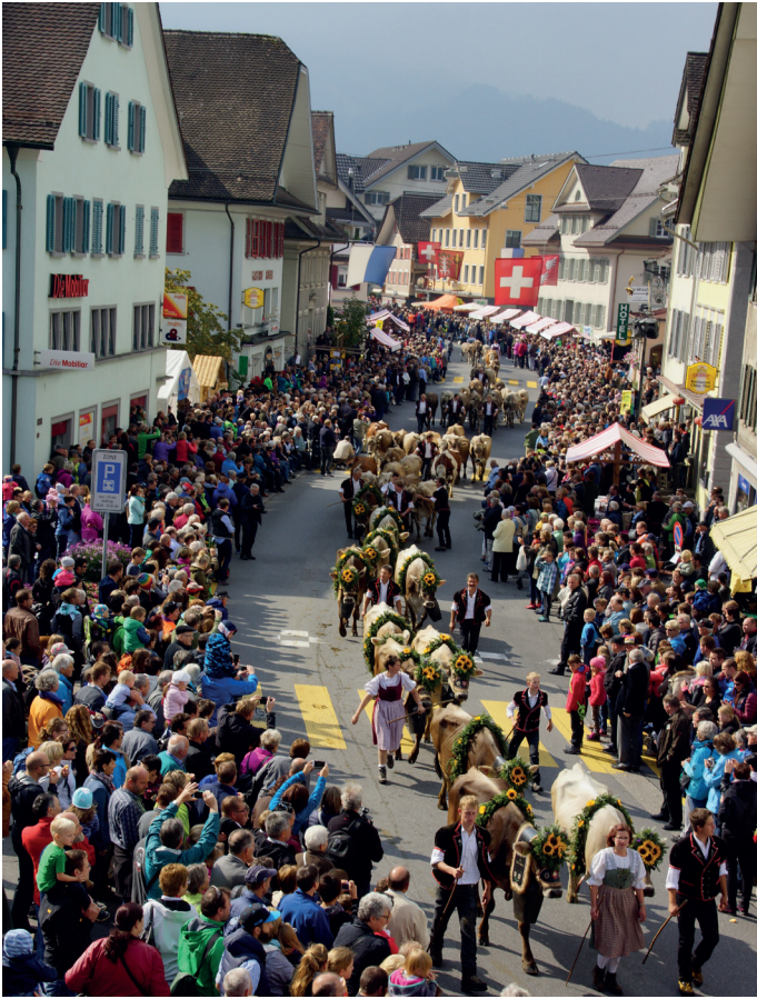
Figure 3 – The Alpabfahrt in autumn attracts over 10 000 visitors, who buy local cheese and meat products.

impact of the EBR in the most relevant fields of activity over the long term. This information will be crucial for political decision-making processes in the EBR, but also within Switzerland and potentially abroad.