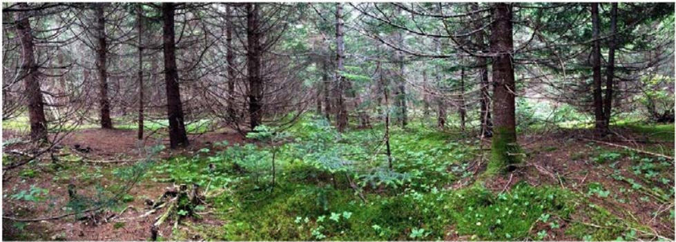
Figure 1 – Panorama of a former field overgrown with white spruce. August 9, 2015.