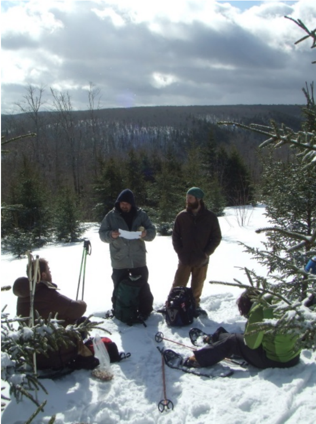
Figure 6: Students contemplate Eigg Mountain ‘wilderness’ from a former field overlooking traditional Mi’kmaq hunting grounds, 2009.

experientially some of the abstract concepts they were reading about in theoretical literature. The concept of a nature–culture hybrid recognizes the ‘agency’ of natural ‘actants’ (Latour, 2004). Humans have carved out artefactual spaces from the forest. What has grown back and the way that that re-growth has reshaped those human interventions is determined by the biological logic of the indigenous and introduced species. The actants respond to and build upon each other’s interventions.