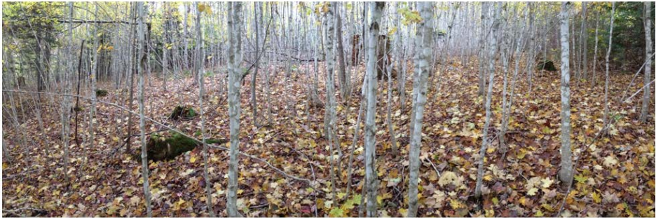
Figure 1 – Panorama of Young Hardwood Stand

This is the lower field of “ the hermit ” and is an example of a former field growing over in hardwood. The view (Figure 1) is looking east across the field from its western boundary (defined by rock piles like the one below (Figure 2)). The hardwood is second growth. The large stumps are from old softwood trees that originally grew up on the field which was probably abandoned in the early 20 th century. This portion of the field is overgrown in the 1945 aerial photo.