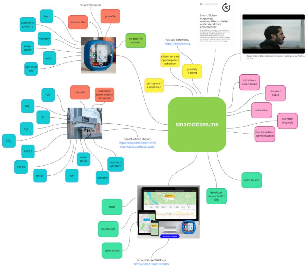
Figure 2: Illustration of the Smart Citizen Kit and Smart Citizen Station, including data points and analysis parameters.