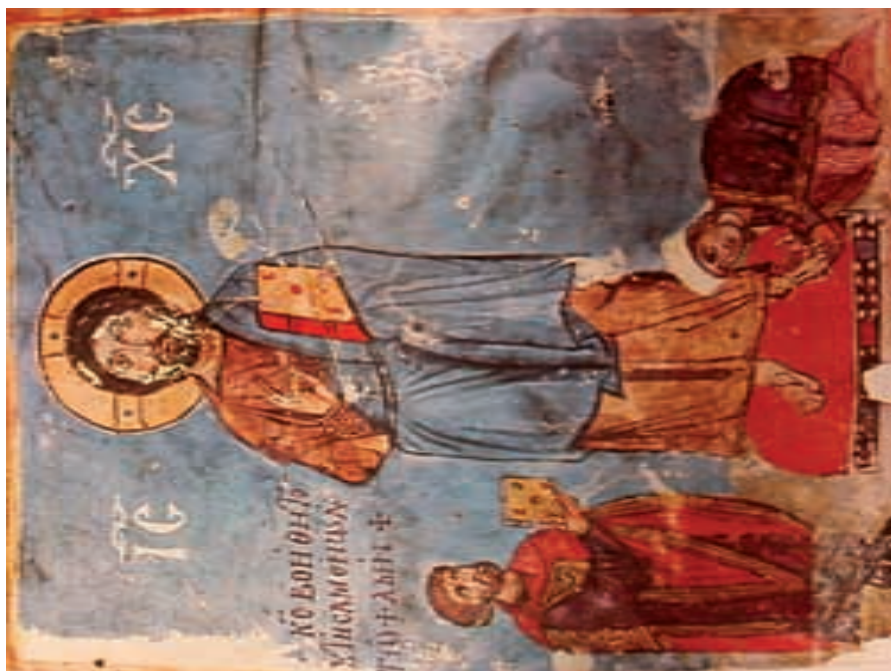
3 Koulou- moussiou 60, fol. I v (before 1169); the proto- spatharios Basil and a female figure, perhaps his wife.