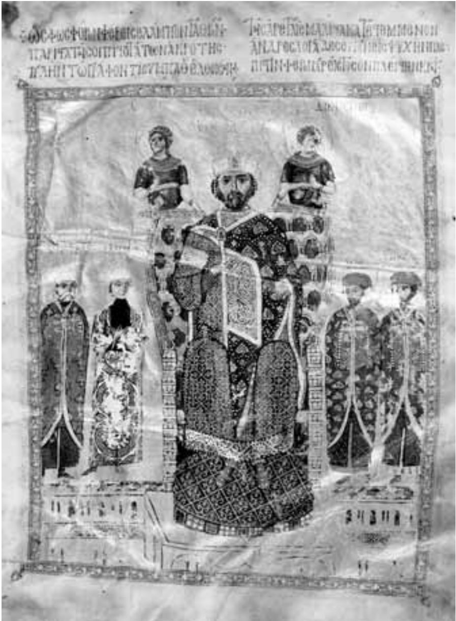
2 Coislin 79, fol. 2 r (1071–1081): Michael VII Doukas (1071–1078) enthroned, flanked by four officials.