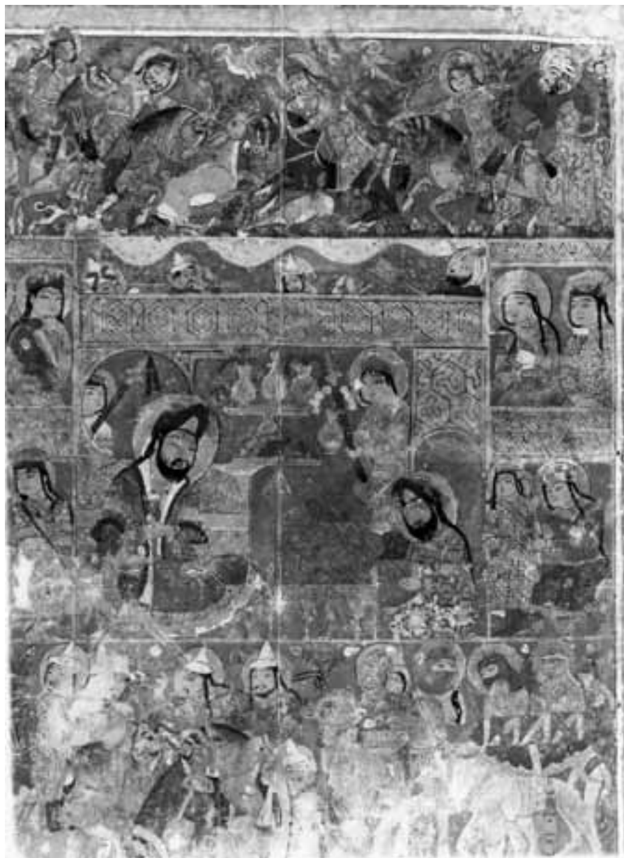
6 Vienna, Österreichische Nationalbibliothek, MS. A. F. 10, fol. 1r (mid-thirteenth century): scenes from the court of a Turkish ruler.