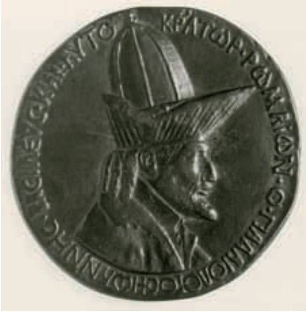
9 Saint Petersburg, The Hermitage, medallion by Pisanello, obverse: John VIII Palaiologos (1425–1448).