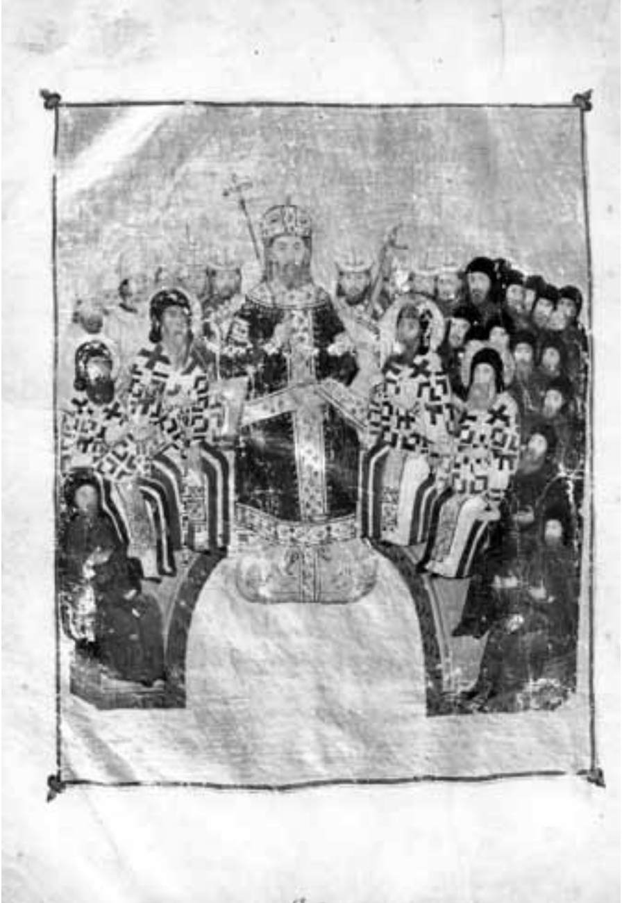
5 Par. gr. 1242, fol. 5 v (completed in 1375): John VI Kantakouzenos (1347–1354) presiding over the Church Council of 1351.