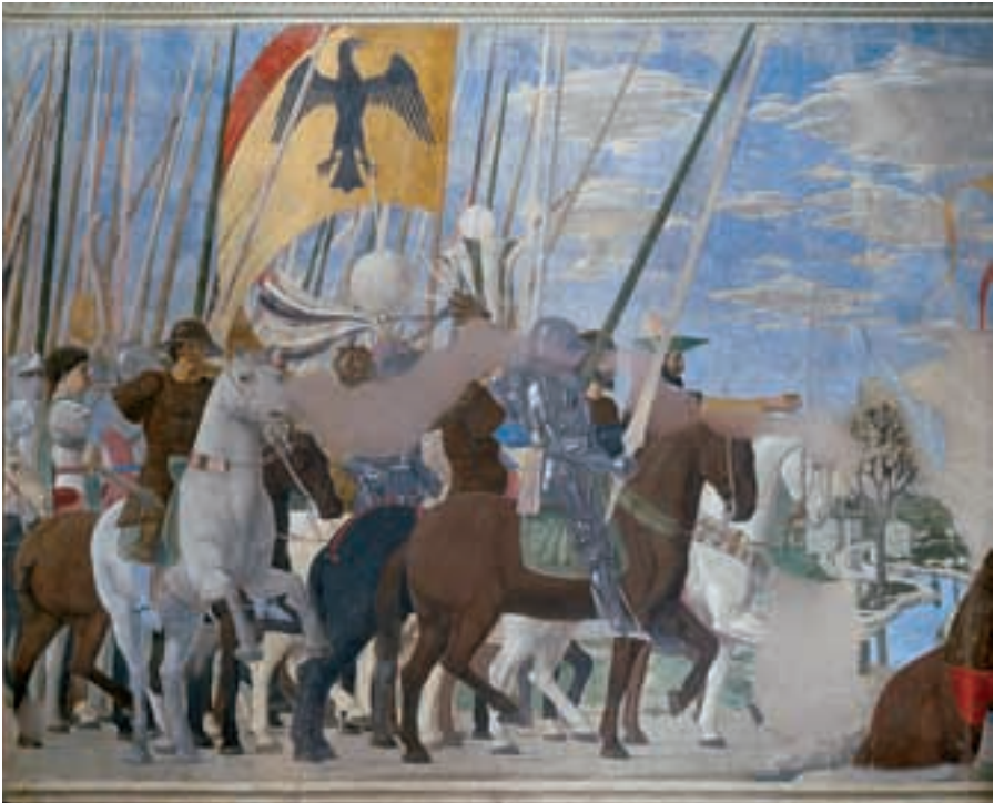
10 Arezzo, San Francesco. Piero della Francesca, Legend of the True Cross: Battle at the Milvian Bridge, detail (c. 1458).