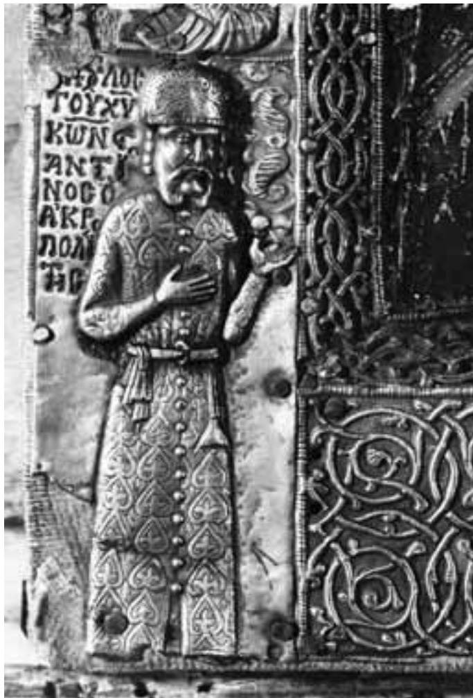
8 Moscow, Tretjakov Gallery, silver-gild revetment of an icon of the Hodegetria (end of the thirteenth-beginning of the fourteenth century): Constantine Akropolites.